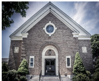
Saint Anthony Parish 126 School Street