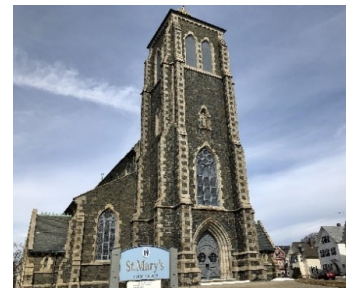
Saint Mary Parish 14 Saint Mary's Square