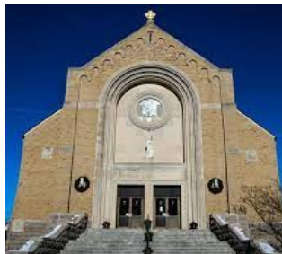
Saint Jude Parish 249 Whittenton Street