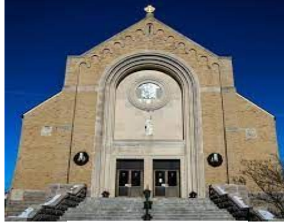
Saint Jude Parish 249 Whittenton Street