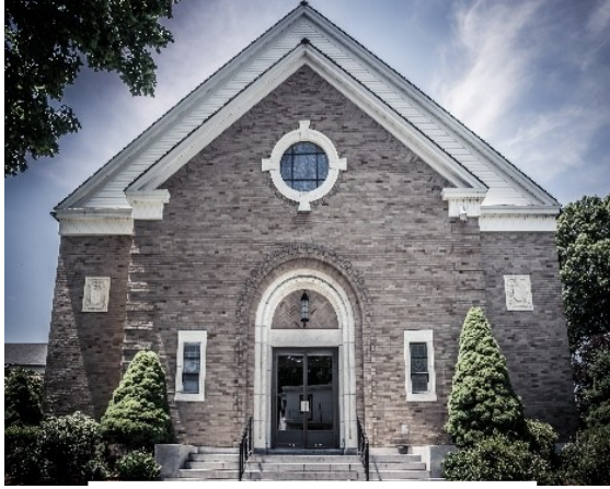
Saint Anthony Parish 126 School Street